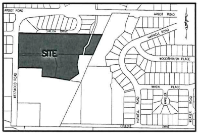
LOCATION PLAN N.T.S.

RECEIVED DP000780 MAR 20 2012 DEVELOPMENT SERVICES CITY OF NANAIMO